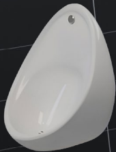
ATLAS BS 50 URINAL