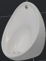
ATLAS BS 40 URINAL