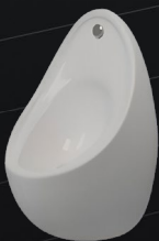
ATLAS BS 60 URINAL