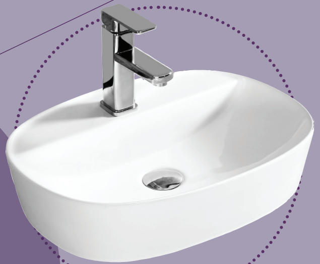
KEI COUNTER TOP BASIN

To be an internationally recognised brand that is acknowledged for our superlative quality standards.