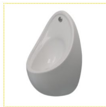
BS 60 Urinal