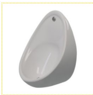
BS 50 Urinal