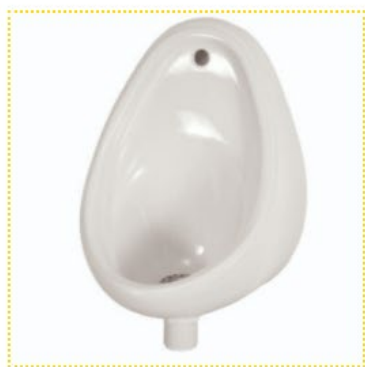
BS 40 Urinal